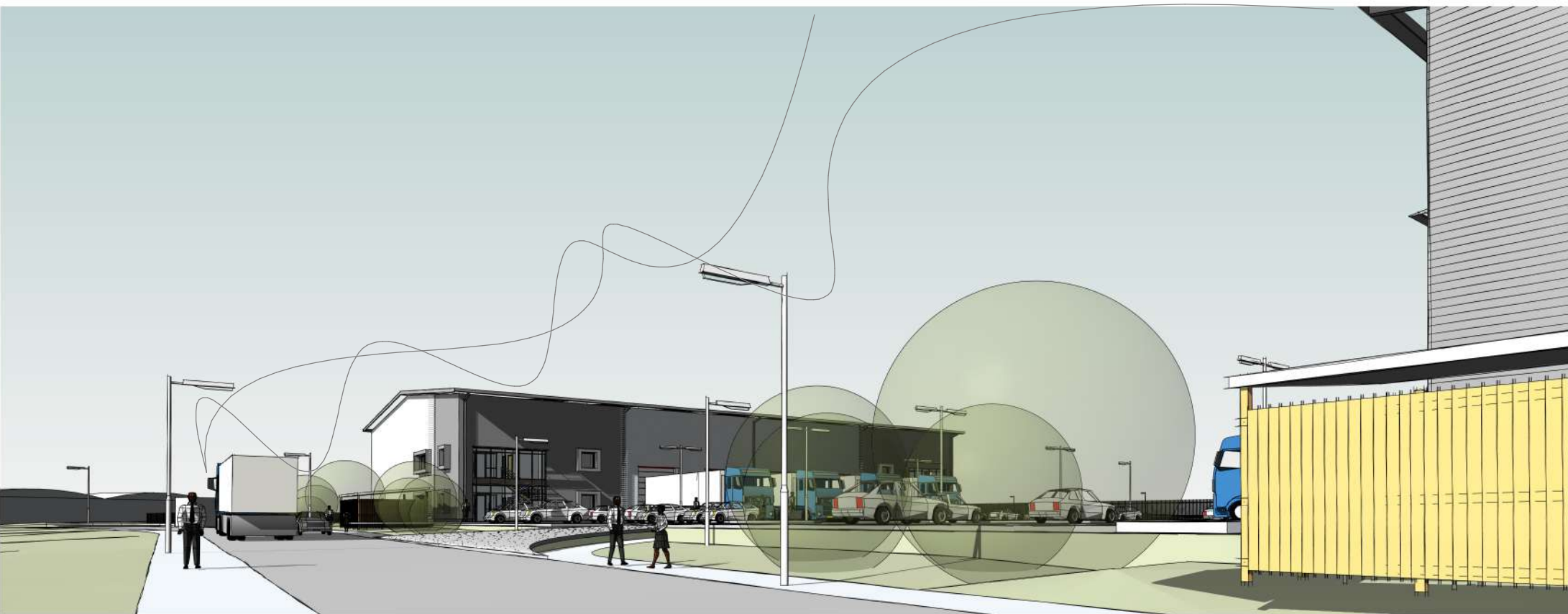
View along Spitfire Way

Notes: Lewis & Hickey accept no responsibility for any costs, losses, claims howsoever arising from these drawings, specifications and related documents unless there is full compliance with the client and any authorised user of the following: 1. All boundaries, dimensions and levels are to be checked on site before construction and any discrepancies are to be reported to the Architect / Designer. 2. Partial Service: Any discrepancies with site or other information is to be advised to the Architect / Designer and direction or approval is to be sought before the implementation of the detail. 3. Block and site plans are reproduced under license from the Ordnance Survey. 4. Do not scale this drawing. 5. For the purpose of coordination, all relevant parties must check this information prior to implementation and report any discrepancies to the Architect / Designer.